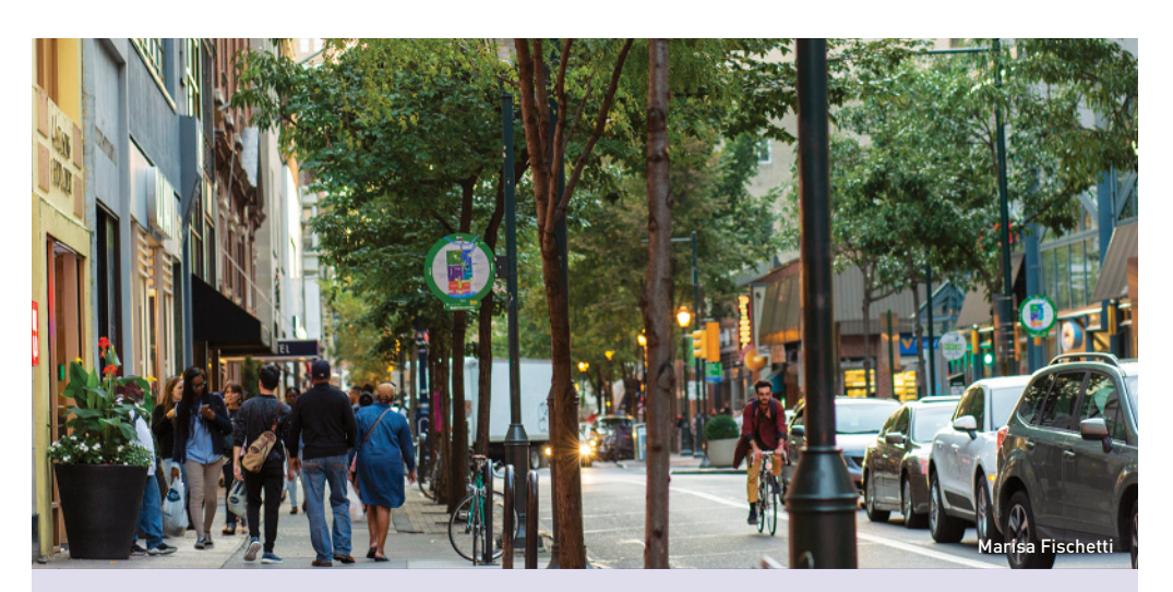
Center City District also maintains 711 trees, including 165 in CCD's four parks, and maintains 362 planters on-street and within CCD parks. In 2018 alone, CCD also planted 285 vines, shrubs and perennials and 4,250 bulbs in its parks, and repurposed nearly all of the plants in Dilworth Park's Wintergarden to enhance the springtime landscaping beds and planters at Cret Park, Collins Park and Sister Cities Park.

For more about CCDF's Plant Center City initiative and how you can help us increase Center City's canopy of healthy street trees, visit supportccdf.org/plantcc