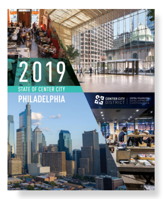
This article is adapted from the introduction to the State of Center City 2019 report. For more, visit centercityphila.org/socc.

in the case of CHOP, adding a major new building in Center City near the South Street Bridge. In fall 2017, Center City's 14 colleges and universities reported total enrollment of 33,913 students. Adjacent to Center City, an additional 78,341 students are enrolled at Drexel, Penn, Temple, and University of the