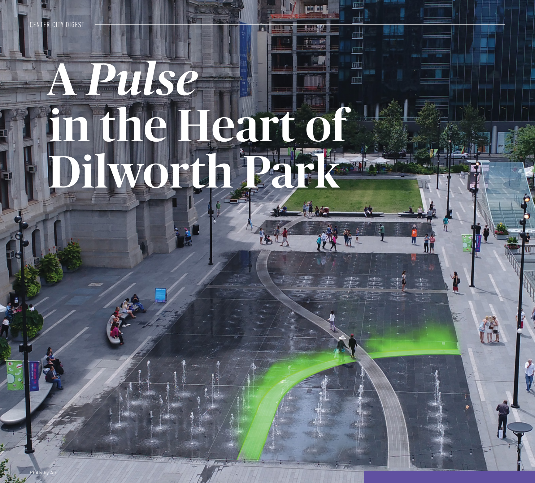
Philly by Air

Thanks to a major grant from the William Penn Foundation, as well as several other generous contributions to the Center City District Foundation (CCDF), the first phase of Pulse comes to life in Dilworth Park.