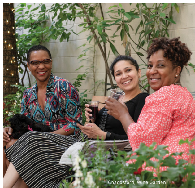
Chaddsford, Wine Garden