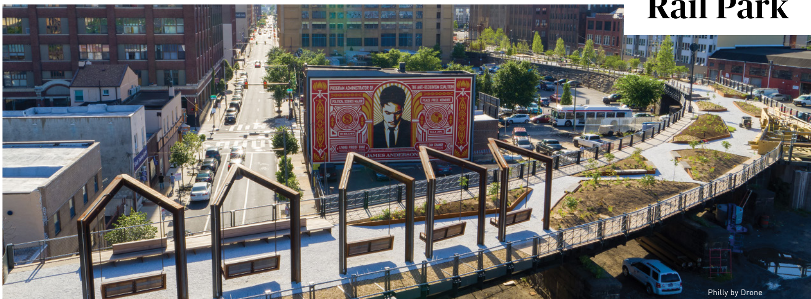
Philly by Drone