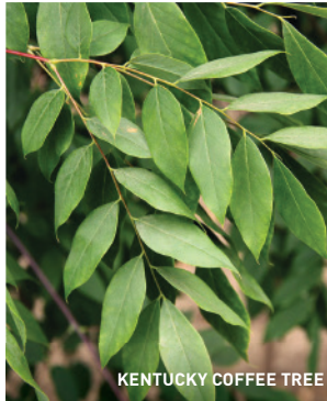
KENTUCKY COFFEE TREE