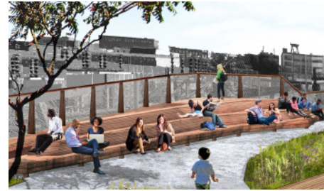
TIERED SEATING $50,000 each

Benefactor Program certificate Listing on donor wall Beautiful 8x10 print