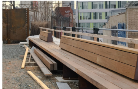
CALLOWHILL BENCH $5,000 each

Commemorative plaque with the inscription of your choosing Framed rubbing of plaque