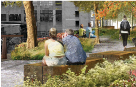
HARDWOOD BENCH $10,000 each

Commemorative plaque with the inscription of your choosing Framed rubbing of plaque Listing on donor wall