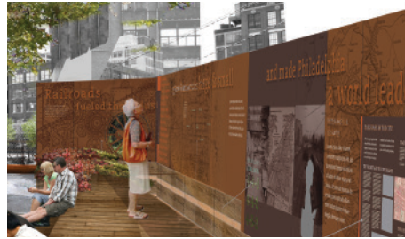
INTERPRETIVE WALL & DONOR WALL $50,000

Commemorative plaque with the inscription of your choosing Framed rubbing of plaque Listing on donor wall