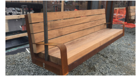
SWING $25,000 each

Commemorative plaque with the inscription of your choosing Framed rubbing of plaque Listing on donor wall