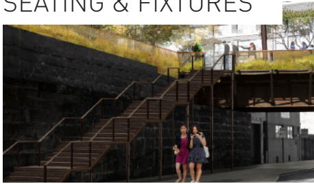
ENTRANCE STAIRS $100,000

Two stairways—one on 13th Street and the other on Callowhill Street—will provide a grand entrance to the Rail Park, rising from the sidewalks of the Callowhill neighborhood to a lush habitat with greenery and landscaped walkways offering panoramic views of Center City.