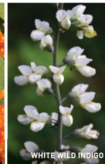
WHITE WILD INDIGO