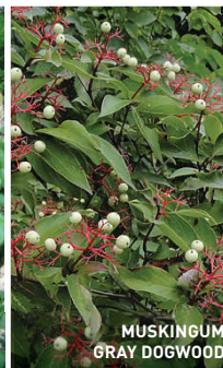
MUSKINGUM GRAY DOGWOOD