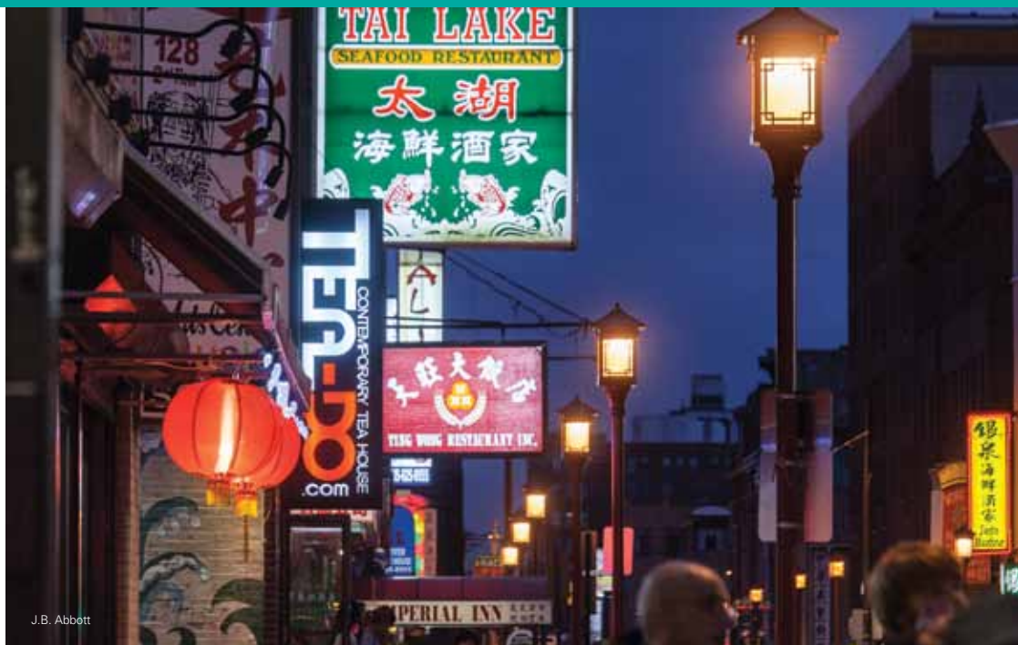
Sidewalks are much brighter now in Chinatown with 46 new pedestrian lights.

In Chinatown, 46 new, red pagoda-style pedestrian lights were installed in the 900 and 1000 blocks of Arch Street plus 10th Street between Arch and Race Streets, extending lighting that the City of Philadelphia had installed last year on 10th Street between Race and Vine Streets. The CCD also installed new floodlights that highlight the Chinatown Friendship Gate, an internationally known landmark and symbol of cultural exchange between Philadelphia and its Sister City, Tianjin, China. The gate is located just north of Arch Street on 10th Street. The Chinatown lighting was