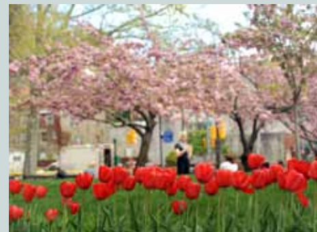
Cret Park, 16 th Street and Benjamin Franklin Parkway, suddenly burst into vibrant color this spring, thanks to the 1,000 tulip bulbs the CCD planted last fall and the prolific cherry trees.