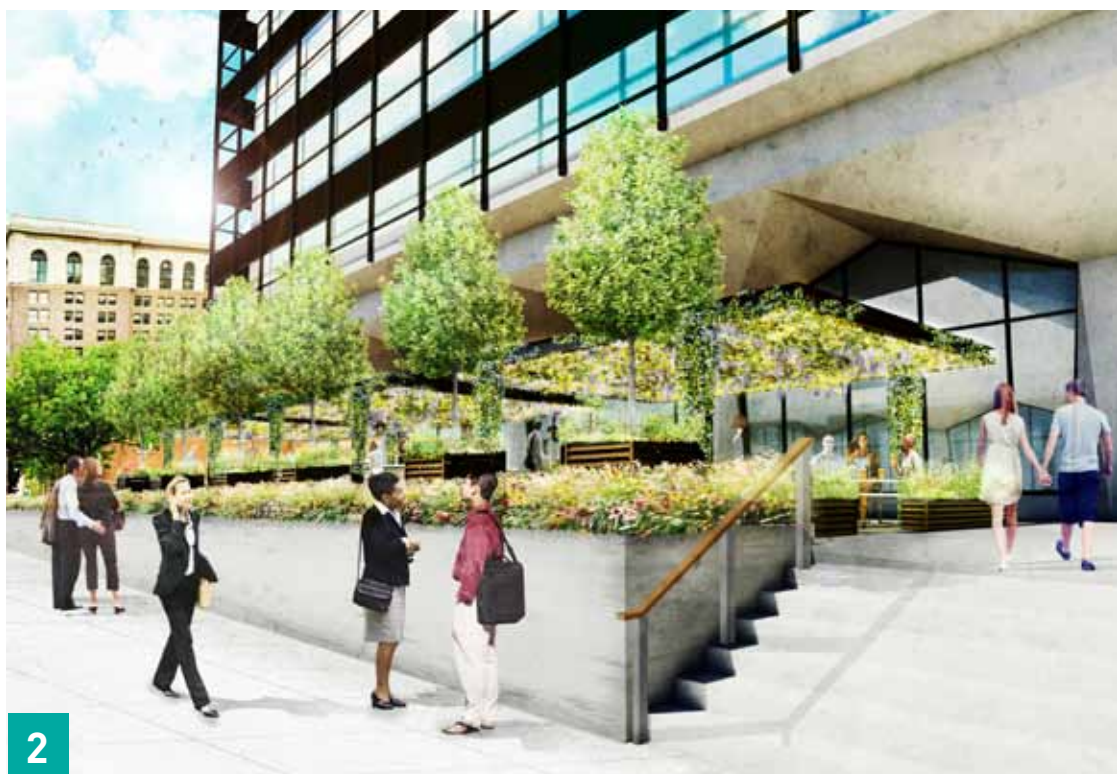
Image 1: As the first step in PREIT's three-block transformation of the Gallery, the fashion retailer Century 21 will occupy 100,000 sf of the ground and second floors of the former Strawbridge's building (building at bottom right in image 1). In subsequent phases, the ground floors of the 900 and 1000 blocks will open onto Market Street and new high-rises could add upper-floor density. Image 2: A landscaped beer garden designed by Groundswell Design Group will animate the plaza level of the Dow Building on Sixth Street.