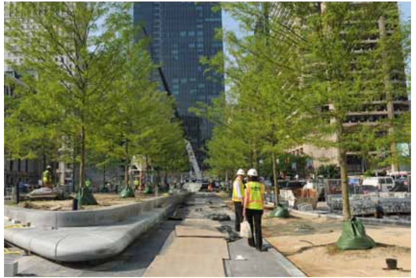
A new café building also provides an information center and elevators that make transit lines more accessible. At right, mature trees line the western edge of the new park.